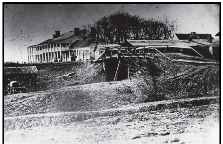
SOME HISTORIANS BELIEVE THAT RSL29 MET AT THE MCCARTNEY HOTEL AFTER THE LODGE WAS DESTROYED BY "THE ENEMY." MCCARTNEY WAS A PAST MASTER

In 1873, a lodge was built on the northwest corner of Bank and Pond Streets and meetings were held (See RISING SUN Page 4)