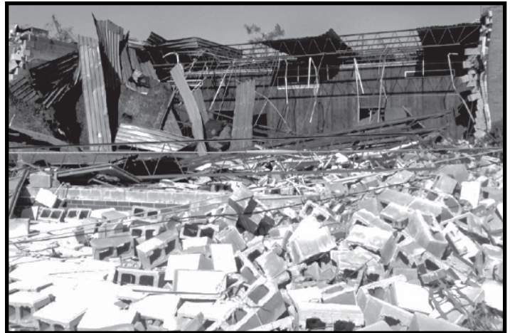
RISING VIRTUE LODGE NO. 4 AFTER APRIL 27TH TORNADO