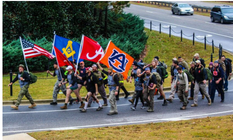
Student Veterans from Auburn University and the University of Alabama who participated in Operation Iron Ruck

On November 24th 2018, just hours before the kickoff of the Iron bowl, I stood on the steps of Bryant-Denny Stadium in Tuscaloosa chanting, "USA, USA, USA!!" While this may not seem to be a big deal to most people, to the student veterans of Auburn University and the University of Alabama, it was. Both student veterans associations had just completed Operation Iron Ruck, a 150 mile road march from Jordan-Hare Stadium in Auburn, to Bryant-Denny Stadium. You read that correctly, 150 miles.