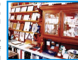
Items on display at the museum