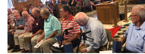
Pictured: The 50, 60 and 70 year Masons who were attended the Awards Day held by Killen Lodge #788

On August 11th, Killen Lodge #788 held an awards day to honor a group of 50, 60 and 70 year masons, some that had not been able to attend in some time. Some traveled from as little as 15 minutes away others as much as 4 hours to be there. We saw old friendships reignited, our lodge was filled to capacity with friends and family; It was a great day of fellowship and great to hear the stories these brothers had to tell.